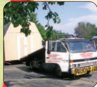
A large mini barn from the Wiles Center is hooked up to a trailer on its way to a new home at the Day Nursery Lilly Center.

2006 was a dynamic, challenging, and successful year in the history of Day Nursery Association of Indianapolis (DNA), Indiana's oldest and largest early care and education agency. We have been serving young children and their parents in the Indianapolis metropolitan area since 1899, and each year brings its successes and challenges. I am happy to report to you (customers, donors, volunteers, board members, and staff) that 2006 was a year of strengthening and developing our abilities to continue this legacy of early childhood education.