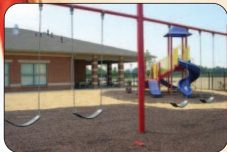
The preschool playground at the Day Nursery Hendricks County center was ready for children July 19, 2006.